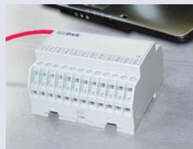
Mobile Use on a Desk