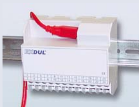
Top-hat Rail Mounting